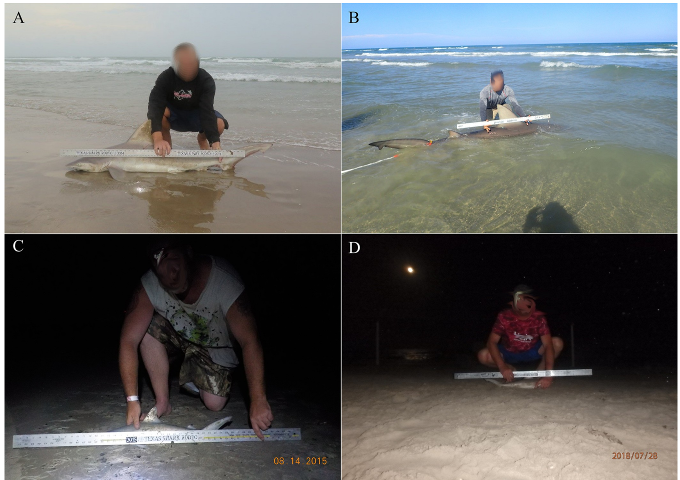
Fig 3. Shark photographs submitted by participants in the TSR where distinguishing characteristic were visible (A) and photographs that were classified as unknown (B-D). A) Confirmed sandbar shark with visible characteristics. B) Angler identified shark as bull shark, but identification could not be confirmed because shark was underwater. C) Angler identified shark as blacktip shark, but identification could not be confirmed because ruler covered most of the shark's body. D) Angler identified shark as a sandbar shark, but species could not be identified because of photo scale, blurriness, and shark's head covered by angler's hand.

https://doi.org/10.1371/journal.pone.0226782.g003